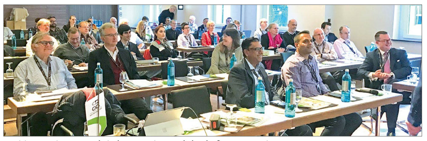
Participants enjoy great technical presentations, and also the funny ITPG quiz

Thursday evening was the first opportunity for everyone to get together, with dinner at TnT Thurn und Taxis Palais, less than a five-minute walk from the hotel. First-time attendees (new PG members) were able to get an impression of the special and friendly atmosphere within the ITPG.