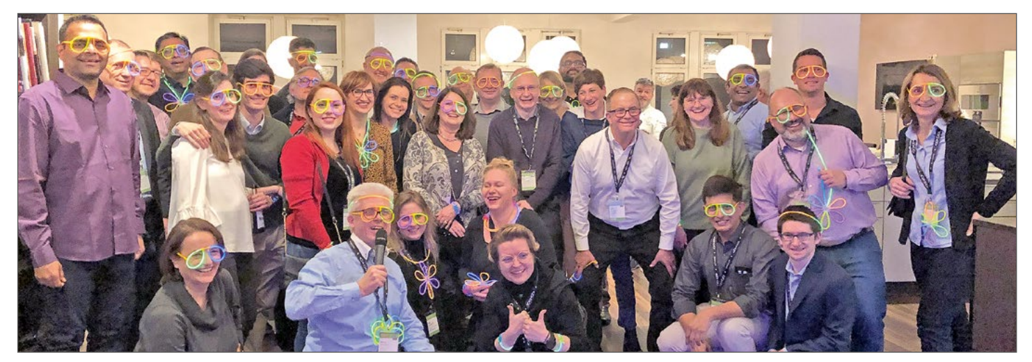
Participants showing off their self-created accessoires made from glow sticks