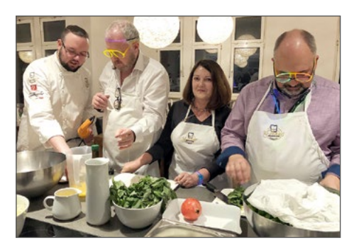
Delegates enjoyed preparing their own dinner

The "Genussakademie Frankfurt" provided an excellent backdrop for the